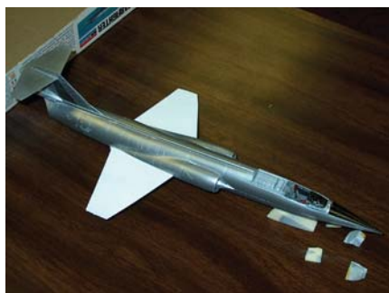
David Reinecke brought in a 1/48 Monogram F-104 that he is converting to an NF-104A by using the Cutting Edge conversions that are supposed to be used with the Hasegawa F-104s! Dave got the Monogram kit in an auction a couple of years ago.