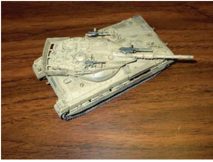
Matt Levesque showed us a 1/72 ESCI Merkava.